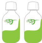
Two bottles of CLENPIQ (5.4 oz each)